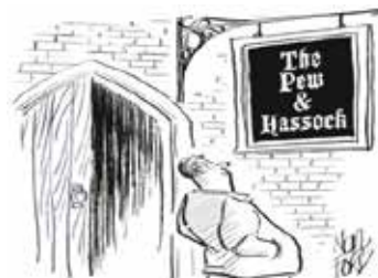
Changing the name from 'St Mark's Parish Church' resulted in a big increase in the number of men attending services

We plan to have a congregational meeting after worship on Sunday 18th June, where we will have the opportunity to discuss the Basis of Union and answer any questions or concerns you may have. Again, please use the box at the Church door (or send me an email) if you would like to submit questions in advance of the meeting.