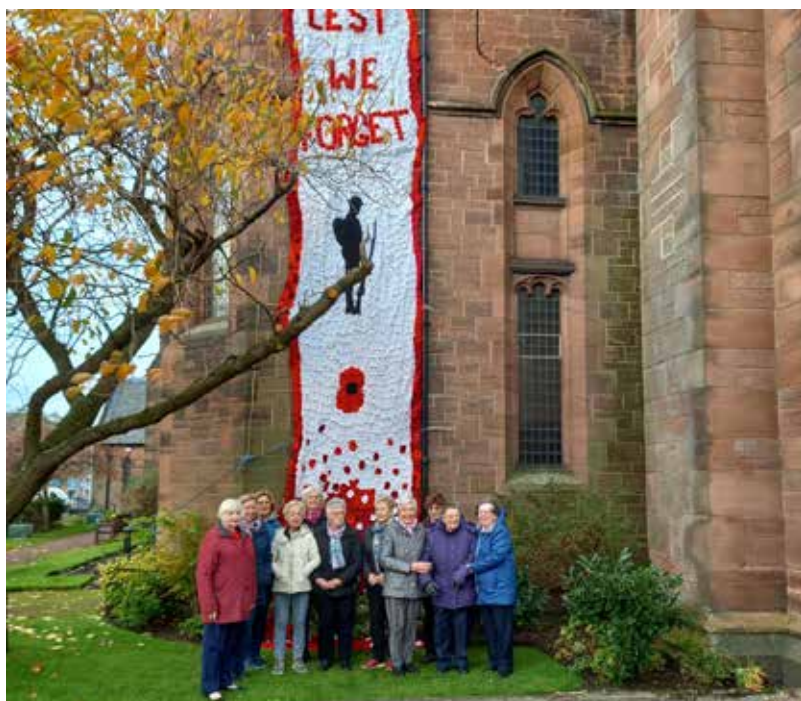
Some Craft Ladies at work.