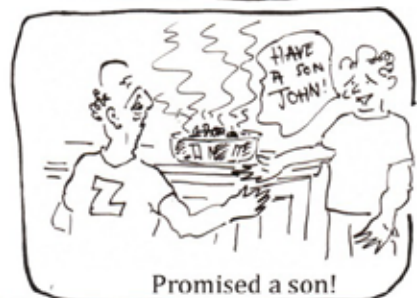
Promised a son!