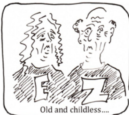
Old and childless....