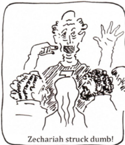
Zechariah struck dumb!